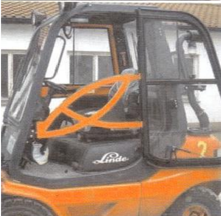
Protection bar A protection bar protects the driver when the forklift makes an overturn