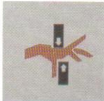
Avoid pinching of limbs