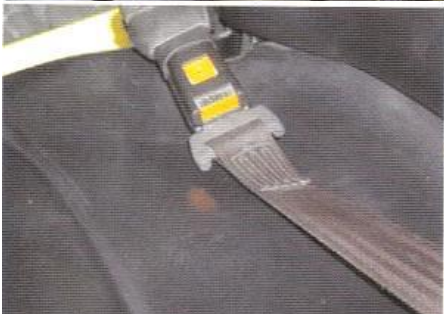
Safety belt. A safety belt protects the driver when the forklift makes an overturn. It is an obligation to wear the safety belt.