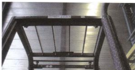
Safety hood Protects the driver against falling load.

Forklifts are equipped with a number of facilities to protect the driver and his surroundings.