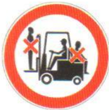
Do not lift persons or let them drive along