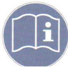
First read the manual