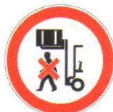
Do not walk underneath A lifted fork