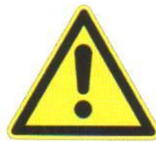
General danger sign